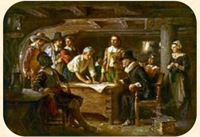
Signing of the Mayflower Compact on board the ship