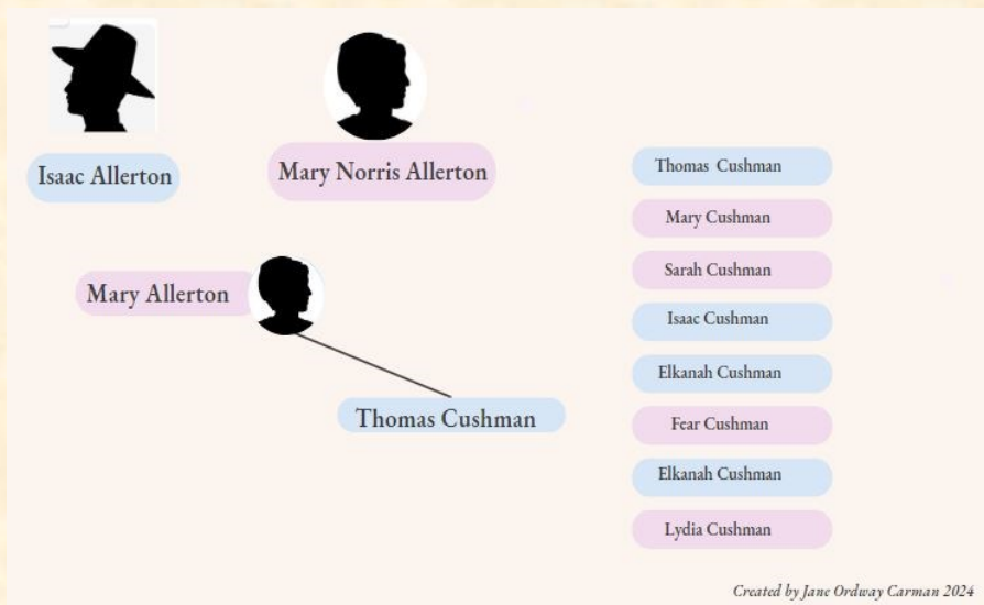
Mary Allerton Cushman family pedigree